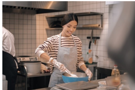
Train for a new job