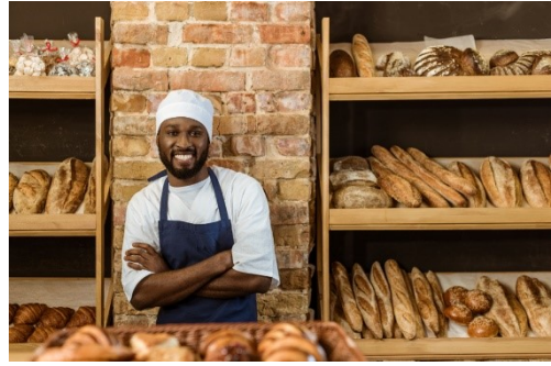
Different tasks and changes