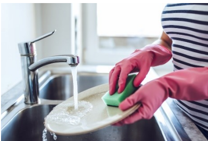
Do a job you know