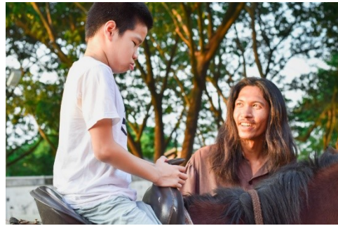
Working with people