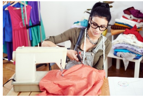
Sitting in one place