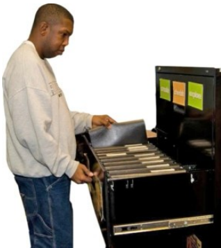
Go to the same place