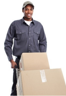
Go to different places