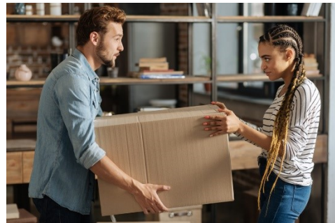
With other people