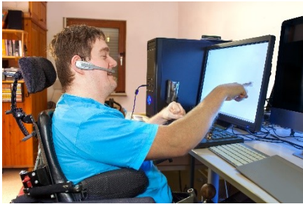
Working with things